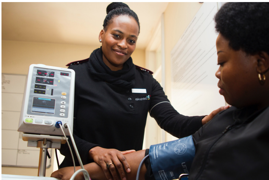
Above: photo by Hush Naidoo