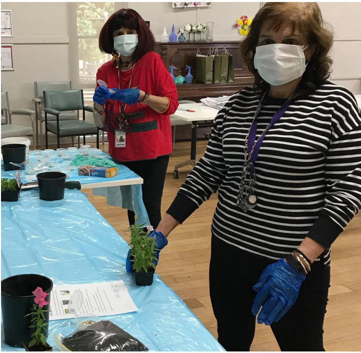
Above: staff assembling wellness packs

to-face service, to a combination of telehealth and outreach services. These included: