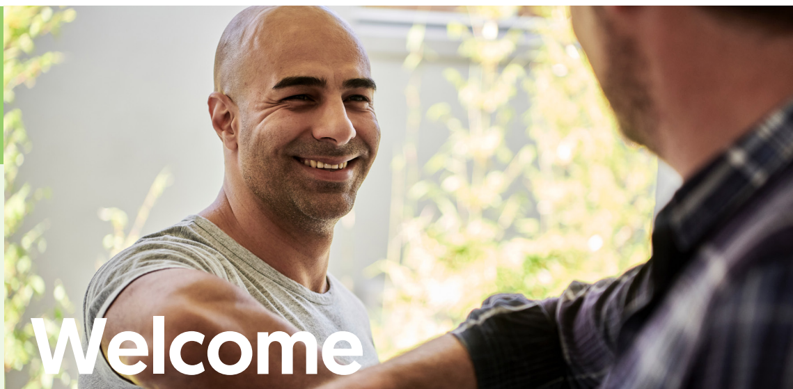
Above: photo by DocuSign

Welcome to the second edition of Research and Innovation for 2021! It's been an eventful few months since our last edition. We are continuing to adapt to the new COVID-normal, adapting our programs and services to ensure the wellbeing and safety of clients and staff. As always, our commitment to health care goes beyond providing health services. We remain active participants and contributors to research and innovation.