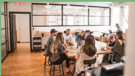
Above: photo by Redd

Merri Health established a research and evaluation committee.