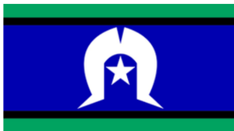
The Torres Strait Islander Flag Designed by Bernard Namok