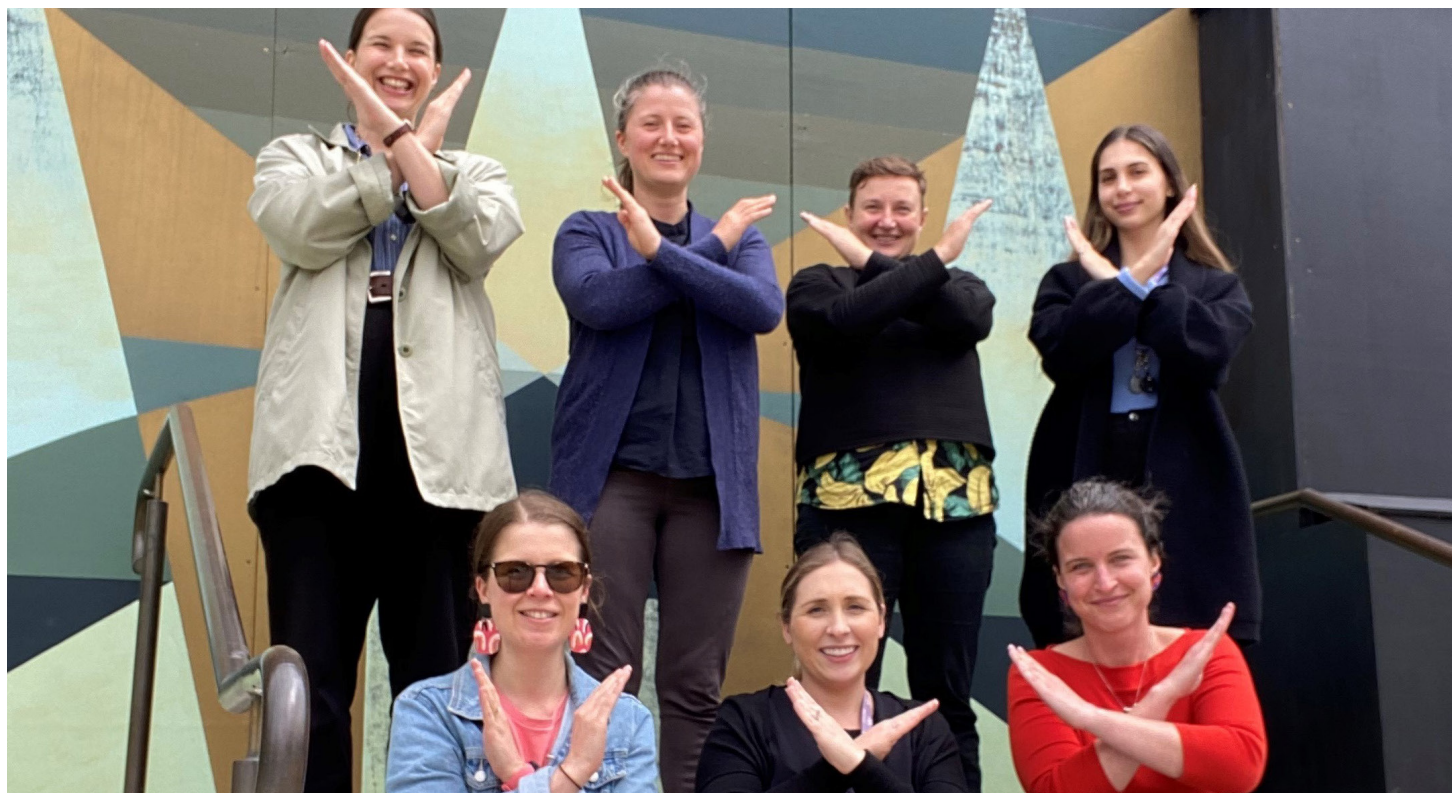
Above: Merri's Community Wellbeing team participating in the #BreakTheBias challenge for International Women's Day

This project will help us work towards strengthening and formalising our commitment to gender inclusivity and safety. We look forward to implementing it”.